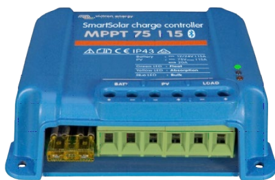
SmartSolar Charge Controller MPPT 75/15