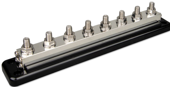
Busbar 600 A with 8 high current terminals and 8 low current screw terminals, without cover