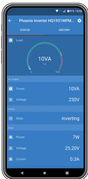
The VictronConnect app