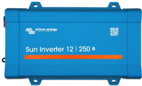
Sun Inverter 12/250