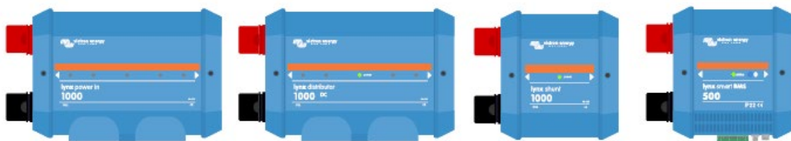
The Lynx modules: Lynx Power In, Lynx Distributor, Lynx Shunt VE.Can and Lynx Smart BMS