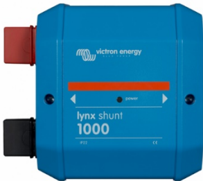
Lynx Shunt VE.Can