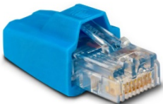
RJ45 VE.Can terminator