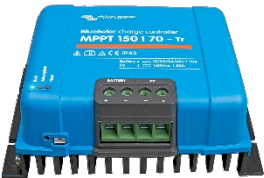
Solar Charge Controller MPPT 150/70-Tr