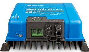
Solar Charge Controller MPPT 150/70-MC4