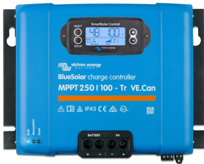
BlueSolar Charge Controller MPPT 250/100-Tr VE.Can with optional display