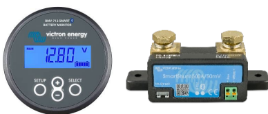
Bluetooth sensing: BMV-712 Smart Battery Monitor or SmartShunt