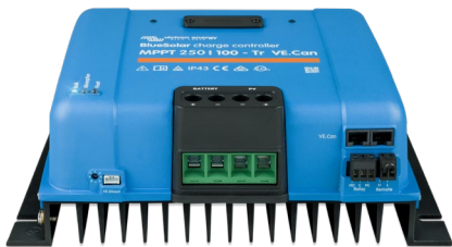
BlueSolar Charge Controller MPPT 250/100-Tr VE.Can without display