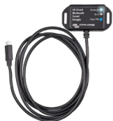
VE.Direct Bluetooth Smart Dongle