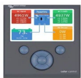
Color Control GX