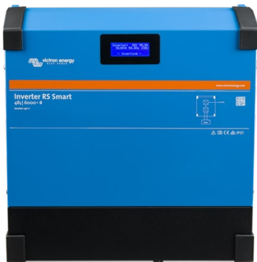
Inverter RS Smart 48/6000