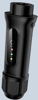
S2-WL-ST (4 Pin)